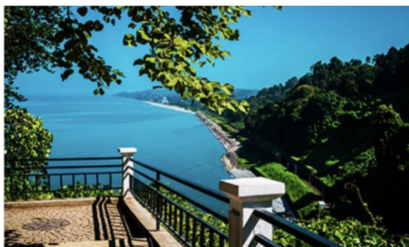
Batumi Botanical Garden