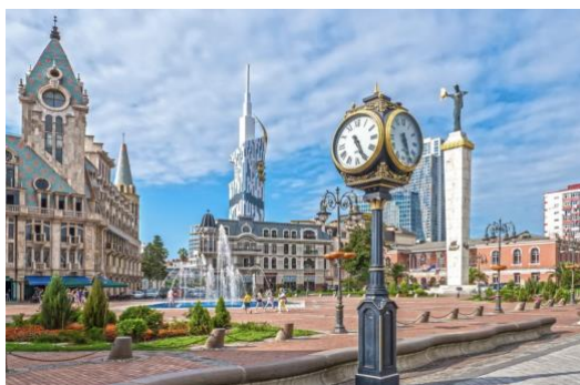
Batumi Europe Square